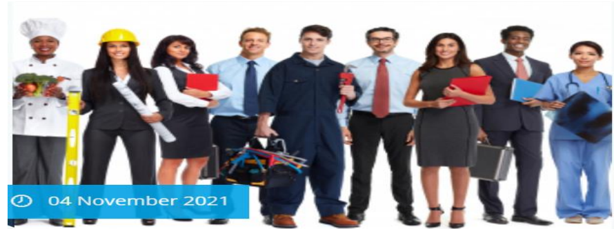
Bienvenidos a Irlanda! - Irish Recruitment Day in Spain